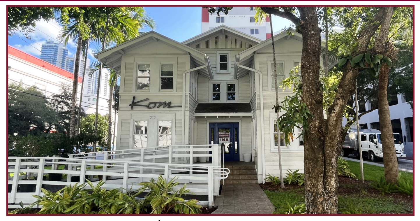
212 NE 24<sup>th</sup> Street, Miami, FL 33137