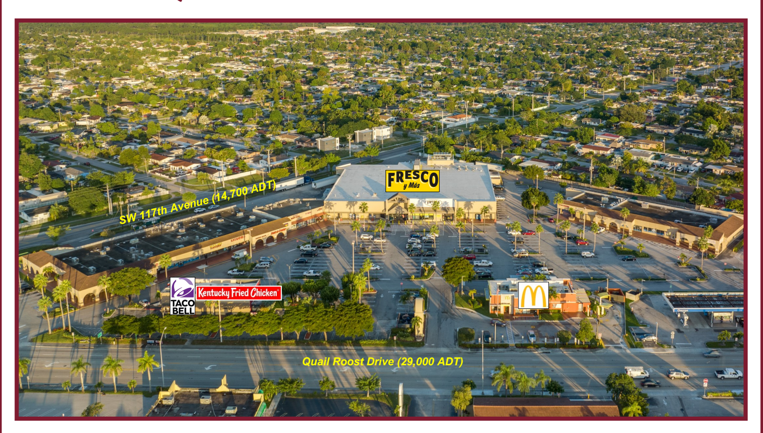
Quail Roost Dr. (SW 186<sup>th</sup> St.) & SW 117<sup>th</sup> Ave., Miami, FL