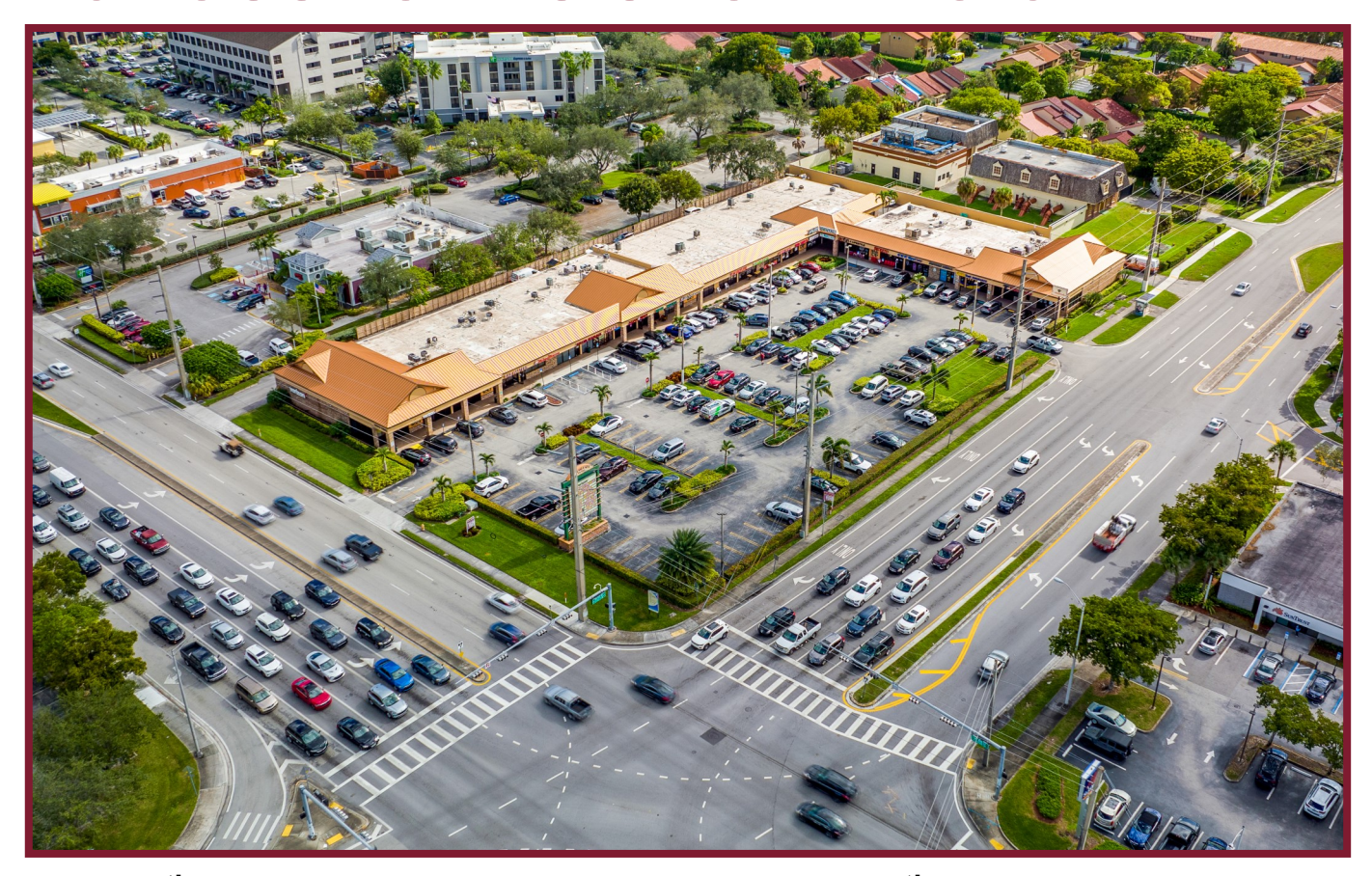
SW 88<sup>th</sup> Street (N. Kendall Dr.) & SW 117<sup>th</sup> Avenue, Miami, FL