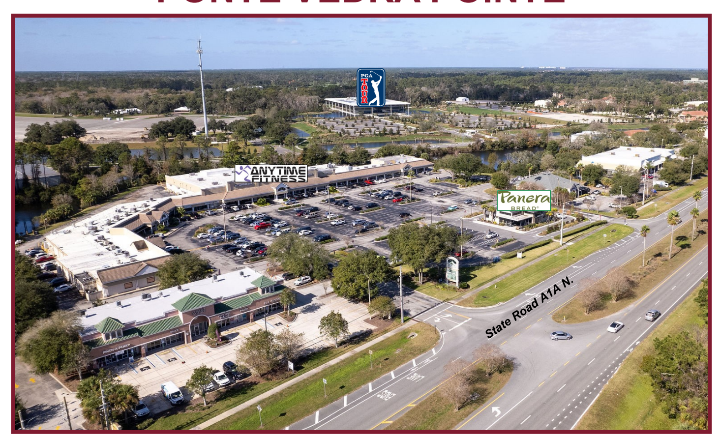
A1A North & Palm Valley Road (CR-210), Ponte Vedra Beach, FL