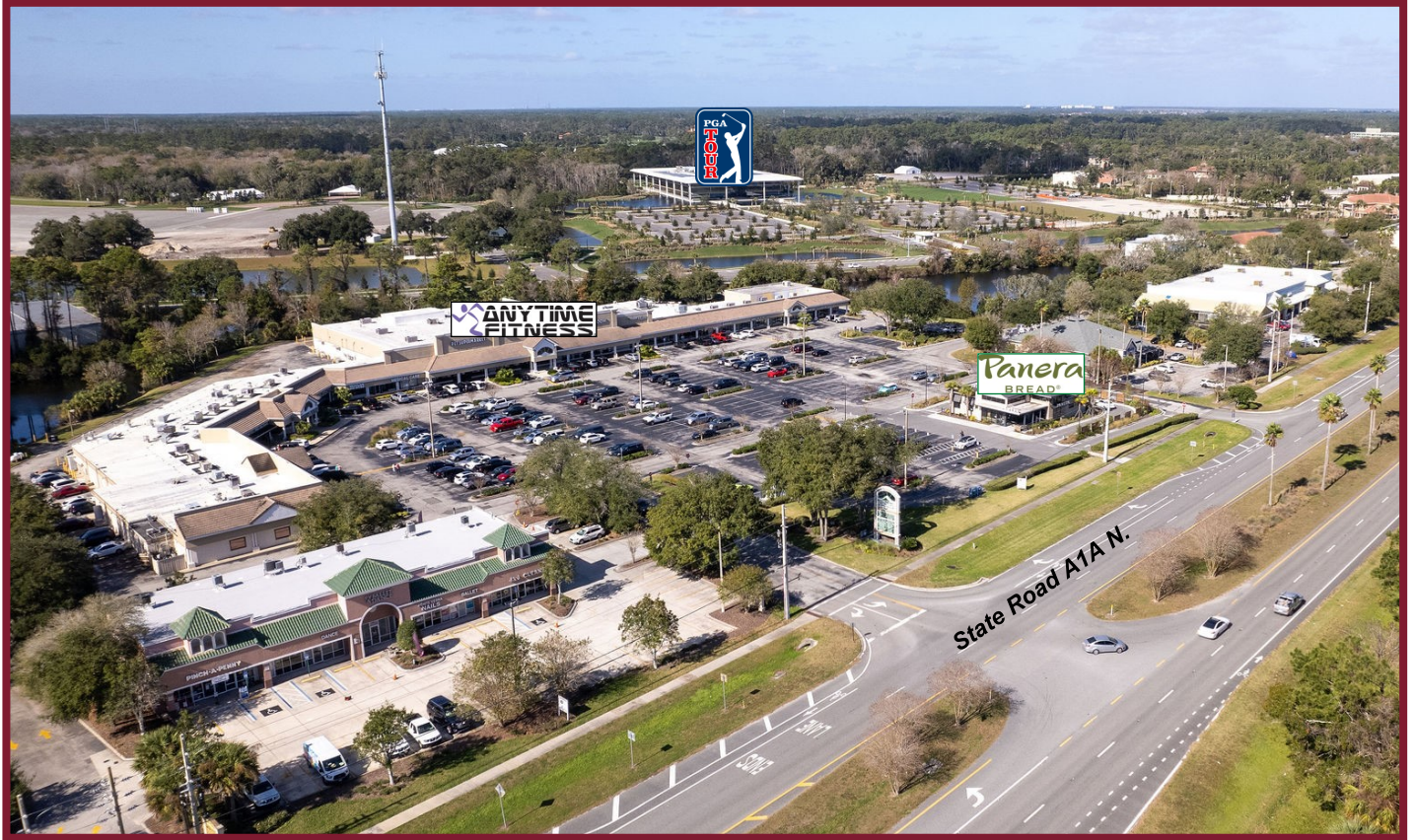
A1A North & Palm Valley Road (CR-210), Ponte Vedra Beach, FL